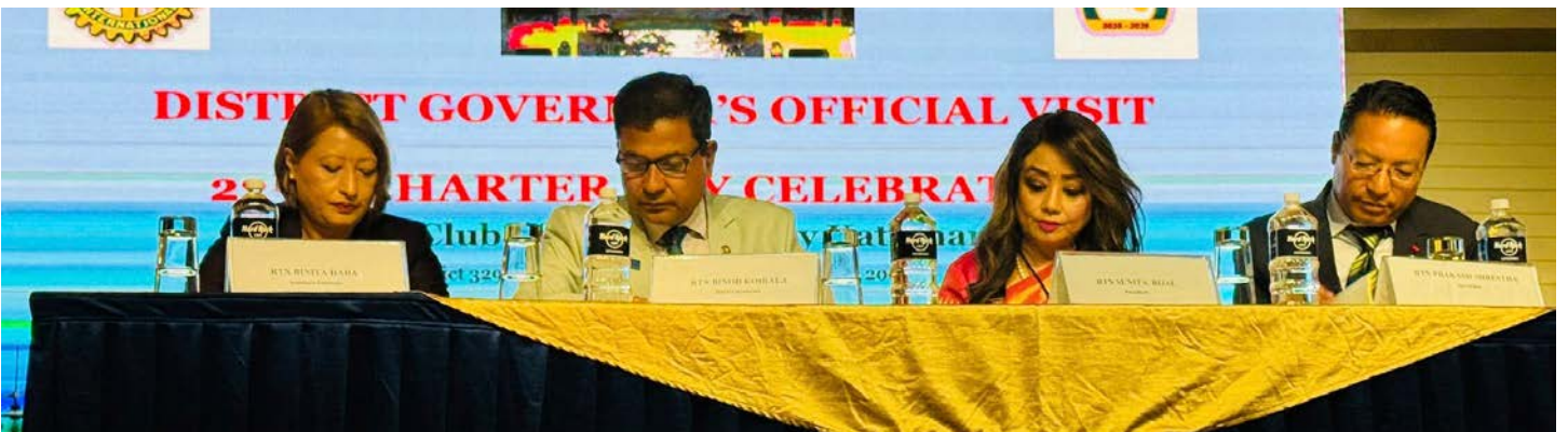
DG Visit RC Newroad City Kathmandu