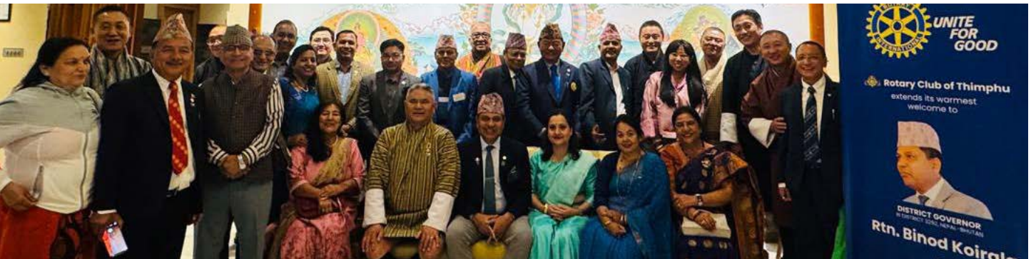
DG Visit RC Thimphu