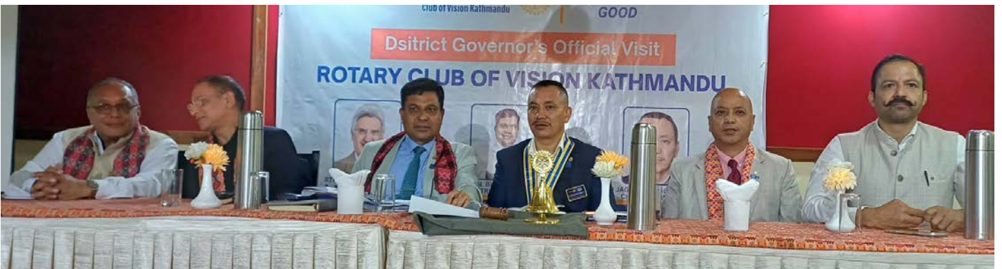
DG Visit RC Vision Kathmandu