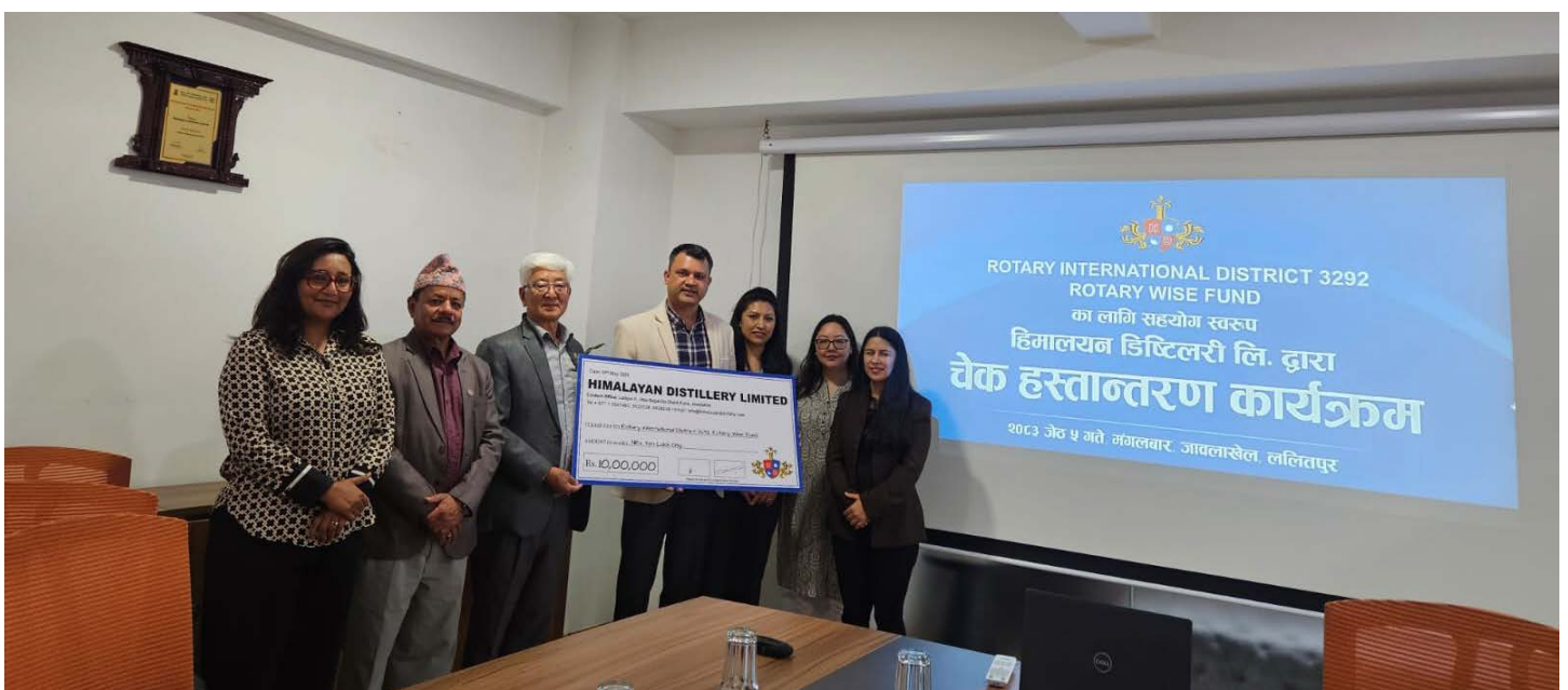
Cheque Handover Program For Rotary WISE Fund by Himalayan Distillery Ltd.