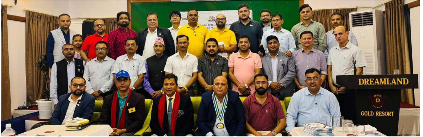
DG Visit RC Rupandehi