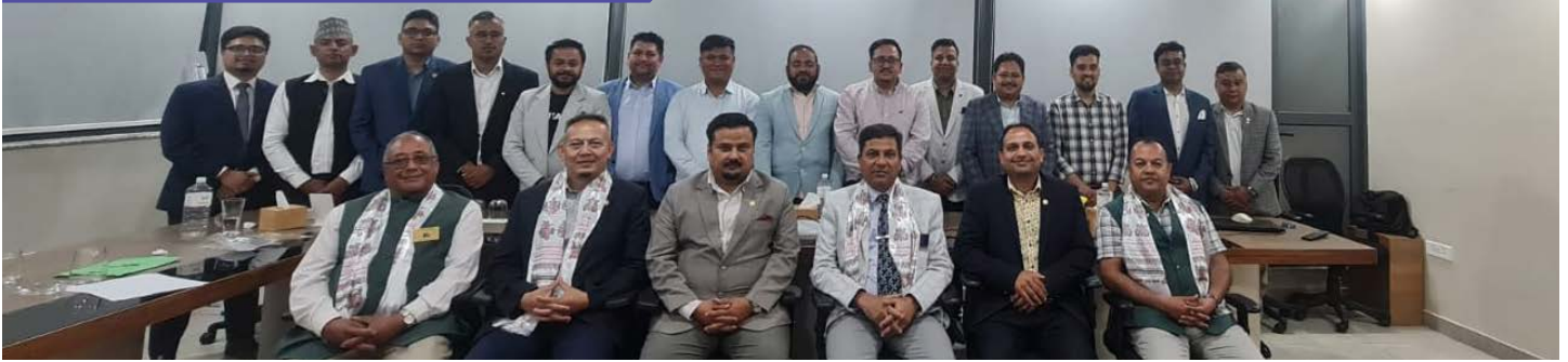
DG Visit RC Greenland Kathmandu

The official club visit of the district governor is among the most significant annual activities in Rotary International. It serves as a vital platform for strengthening relationships between district leadership and individual clubs, enhancing member engagement, and ensuring that clubs remain aligned with Rotary's mission and strategic priorities. These visits reinforce accountability, encourage collaboration, and foster a shared commitment to service.