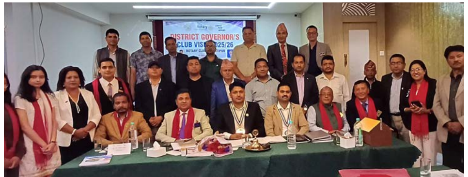
DG Visit RC Kirtipur