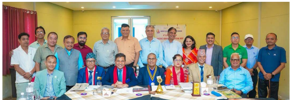
DG Visit RC Lumbini Siddharthanagar